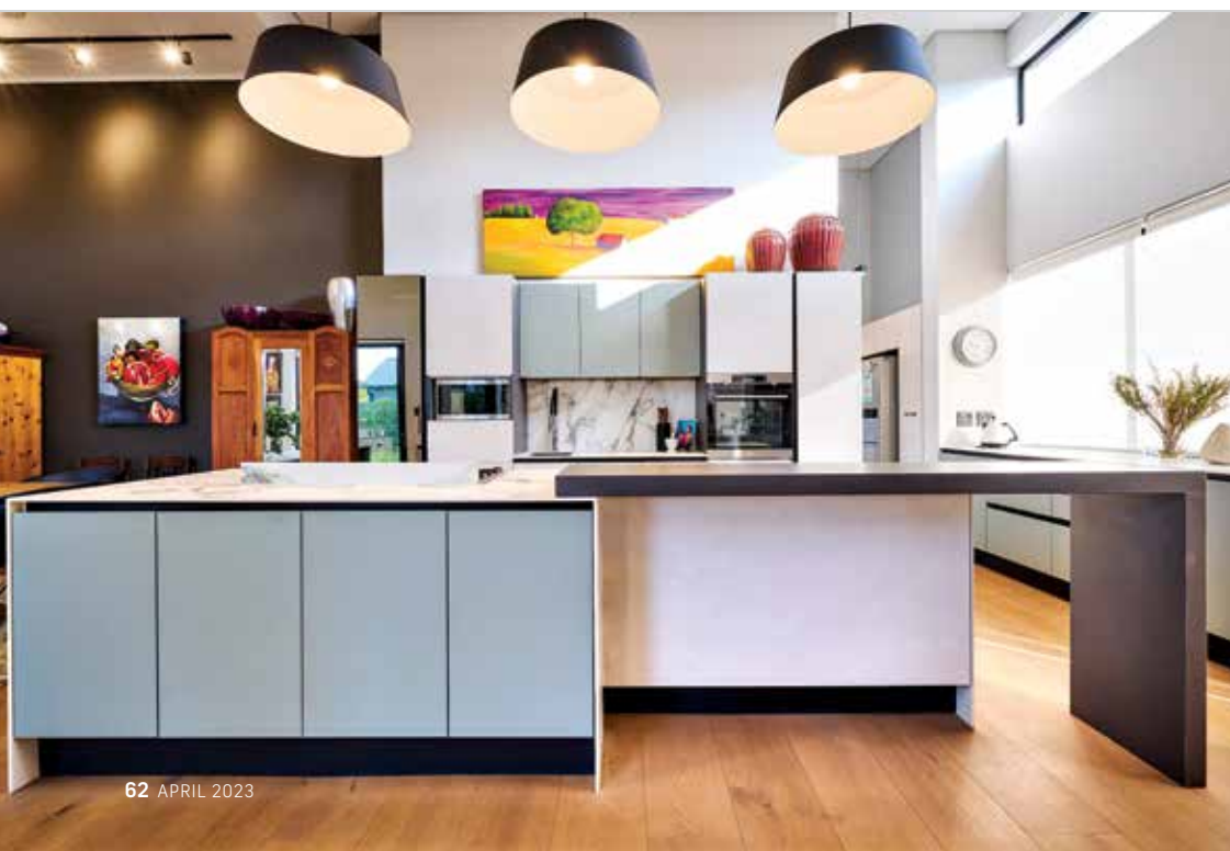
F-ARCHITECTURE 083 286 8652

PLEASE REMOVE THE KREEPY FROM THE SIDE OF THE POOL