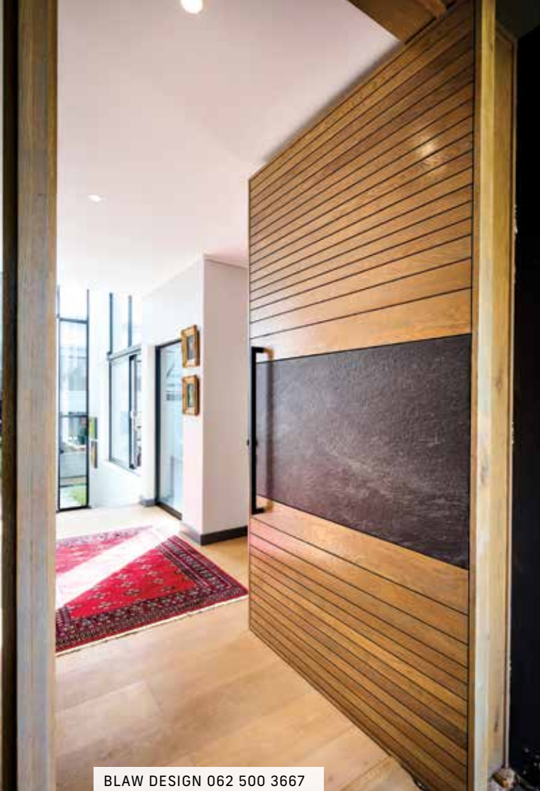
BLAW DESIGN 062 500 3667

ABOVE: Blaw Design manufactured and installed the custom door made from solid oak wood with a rough stone insert. The Pretoria-based design and custom-manufacturing door company is known for its wooden door masterpieces and statement home fronts.