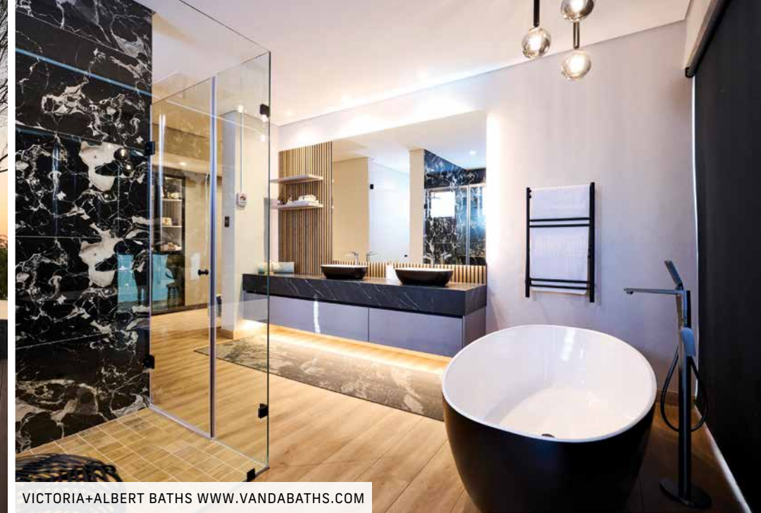
VICTORIA+ALBERT BATHS WWW.VANDABATHS.COM

Two standout rooms capture the spirit of the residence. The main bedroom, flooded with natural light, opens onto an uninterrupted view of the game reserve making it perfect for watching the day end in the golden hues of the magnificent South African sunset. The cinema room, on the other hand, offers a complete escape from the outside world with dimmed lights and surround sound providing the perfect backdrop for the family to immerse themselves in their favourite movie.