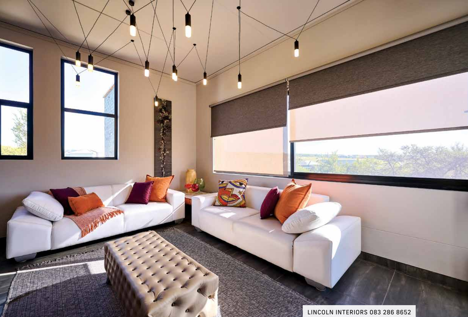
LINCOLN INTERIORS 083 286 8652